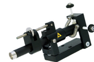
H50 Spotlight Targeting System