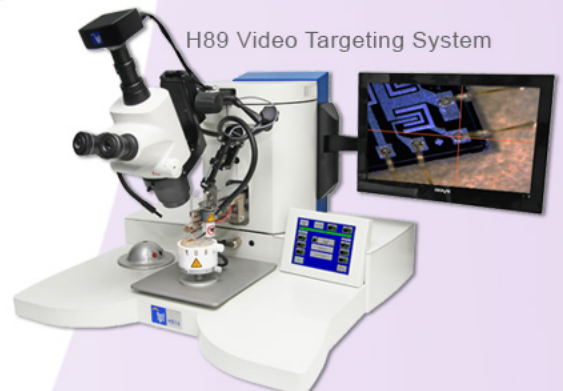
H89 Video Targeting System