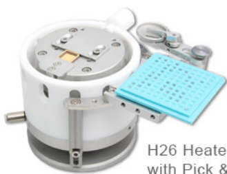
H26 Heater Stage with Pick & Place