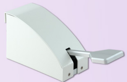
H51 Manual Z-Axis Control