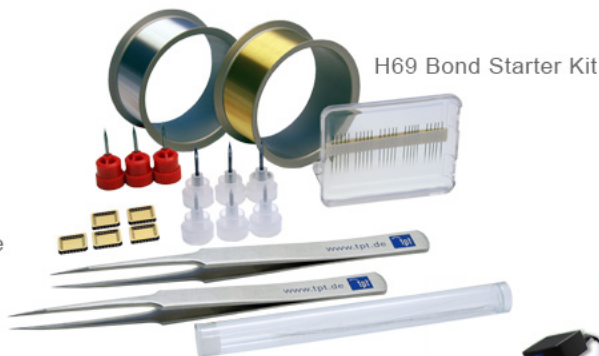
H69 Bond Starter Kit