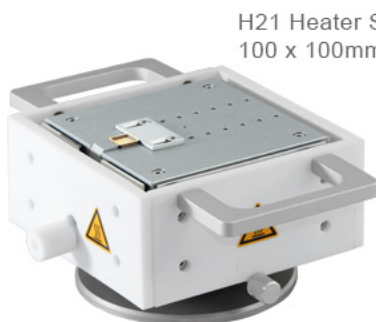
H21 Heater Stage 100 x 100mm