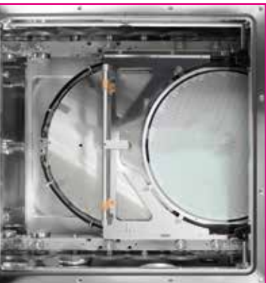
View into the process chamber of VADU 200XL-W.

The soldering systems of type VADU 200XL are equipped with two separate process chambers and can be operated with paste as well as preforms.